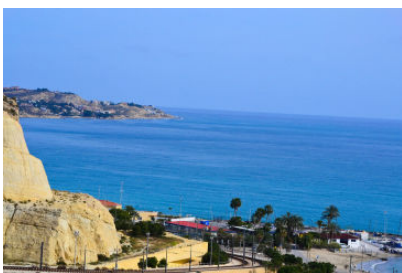
View from the hotel.

At 19:00 we will take the bus to take a look to the Village of the VOR. Then we will take a walk to the Royal Regatta Yacht Club where we will have dinner at the Aldebaran Restaurant at 21:00.