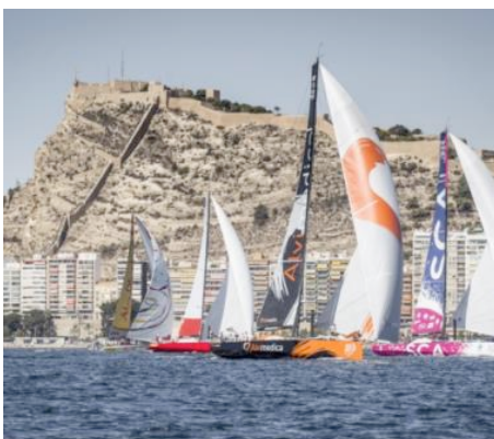
The castle from the water.

By 16:30 we will go back to Alicante to visit Santa Barbara Castle by half past five.