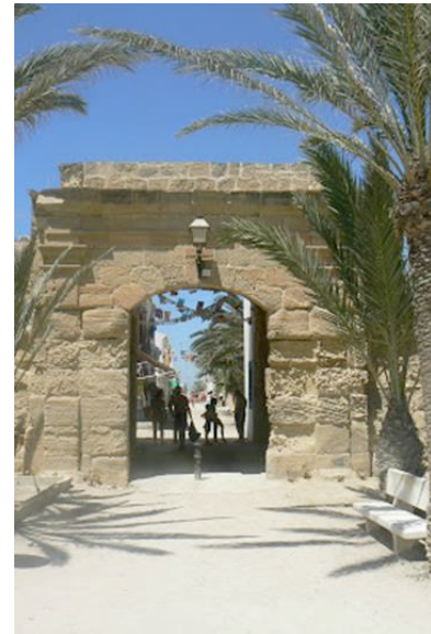
Tabarca Island and one of the gates of the old town.

By 16:30 we will go back to Alicante to visit Santa Barbara Castle by half past five.