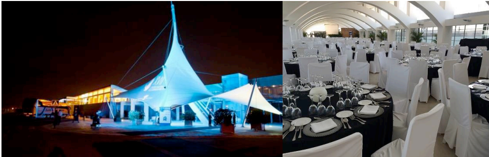
The Cruise Terminal.

After lunch, at 16:30 the bus will take you back to the hotel. At 19:00 the buses will go to the Cruise Terminal where will be held the Business Meeting and the dinner with the Flamenco Show.