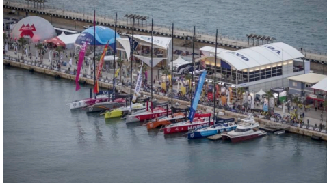
Village of the VOR.

Friday morning, at 10 o'clock we will take the bus to visit the VOR Village. 11:30 we will depart from here to Tabarca Island where we will walk around this old "prisoners island" and taste the typical fish meal "caldero de Tabarca".